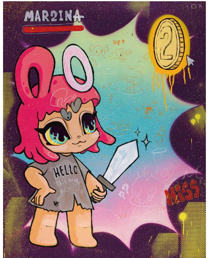
New Player _ 2024 _ 壓克力顏料、噴漆於畫布 Acrylic and Spray Paint on Canvas _ H117 X W91.5 X D5 cm

When I was little, I was always addicted to games. But as I grew up, I realized that life is like a level-based game with only one life. You never know what monster you'll encounter in the next level. A single careless mistake could result in logging out from the game of life forever.