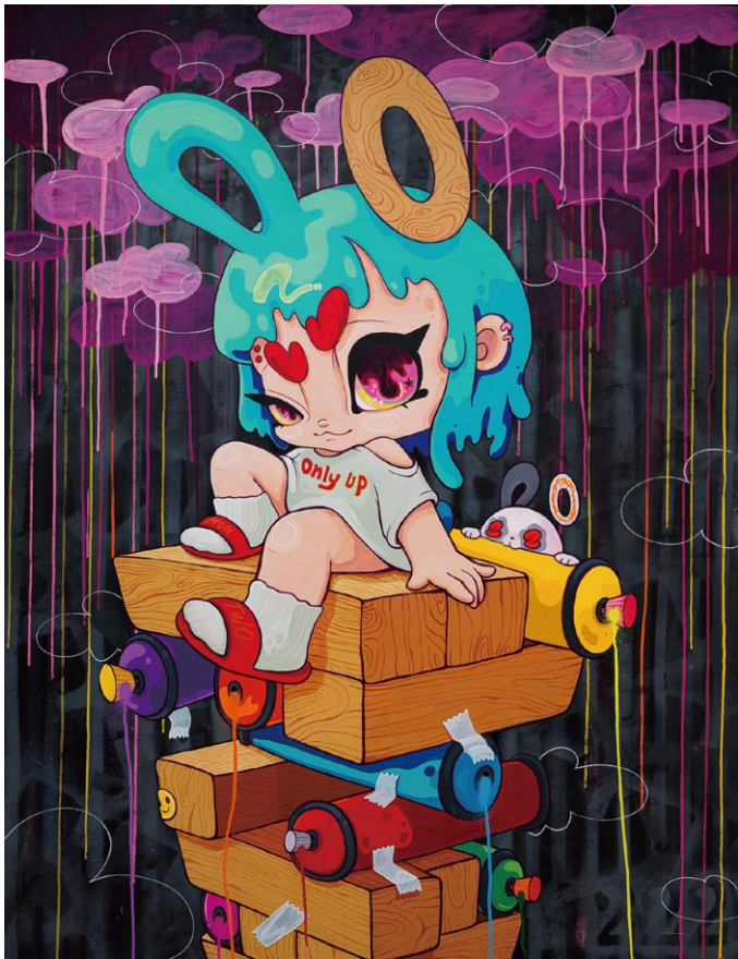
Don't Look Down _ 2024 _ 壓克力顏料、噴漆於畫布 Acrylic and Spray Paint on Canvas _ H145.5 X W112 X D5 cm

對於創作,MAR2INA比喻成沒有文字、只有圖像的日記;對她來說他不喜愛設定任何東西,而她卻能將所有描繪出來的物件轉化為自己的元素並且很自然而然的架構出屬於MAR2INA的世界觀。