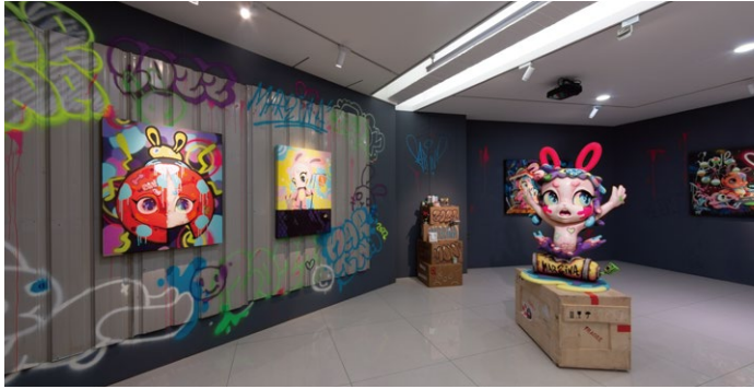
Solo Exhibition "The Rabbit In My Dream", in December, 2021. Installation View at Der-Horng Art Gallery

從小個性孤僻喜愛獨自一人畫圖,幼稚園時期畫圖時被同學撞到畫筆影響構圖,後來因為幼稚園主任將畫錯的筆畫延伸成一條魚,從此啟蒙了MAR2INA從來不怕畫錯的習慣,也因為這樣的習慣成就了現在即興以及天馬行空的創作方式。