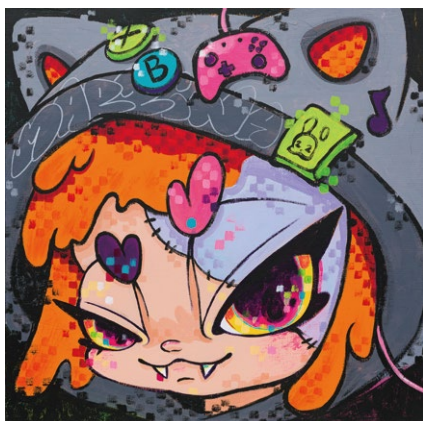
Player1_ 2024 壓克力顏料、噴漆於畫布 Acrylic and Spray Paint on Canvas H45 X W45 X D2.5 cm

The German word "MARINA" originally denotes "woman of the ocean," and it also carries the meanings of artistic talent, passion for colors, and meticulousness. She incorporates the number "2" into her name, symbolizing her lucky number, her birthday, and the pronunciation of the Chinese word "兔 (tù)," which stands for "rabbit."