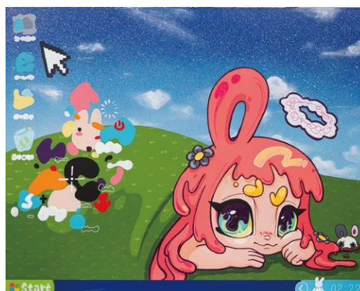
My Mom's Computer 2024 壓克力顏料、 噴漆於畫布 Acrylic and Spray Paint on Canvas H73 X W92 X D5 cm