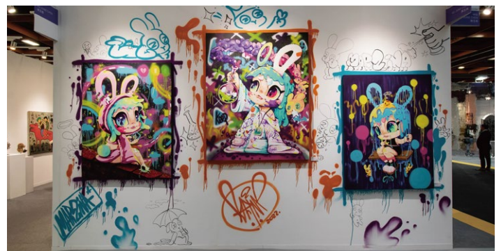
Group Exhibition "The Rabbit In My Dream", in October, 2022. Installation View at Art Taipei