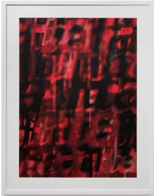
Romance, 2023, Silkscreen ink on paper, H76 × W55.6 cm

Yamada's works carry a sense of irony, sometimes even seeming a bit comical, but he captures various subjects and phenomena from a unique distance, creating slight "deviations" in viewers' perceptions that prompt them to question what they see.