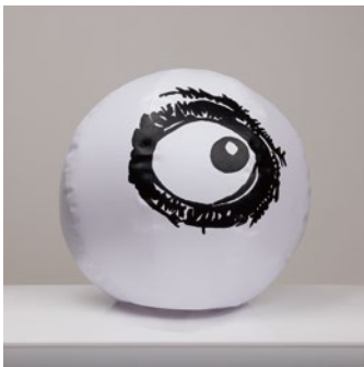
EYE f, 2024, Vinyl chloride, φ30 cm

展場內飄動的氣球・充斥著牆面的笑聲・究竟是跟著誰走？抑或是誰在發笑？空間內浮動的資訊・留下的是無限的空虛・以及隨之起舞的我們。