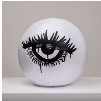
EYE e, 2024, Vinyl chloride, φ30 cm